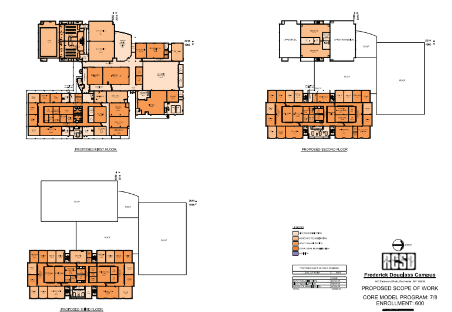
Summary of Expected Rehabilitation Throughout Frederick Douglass Campus