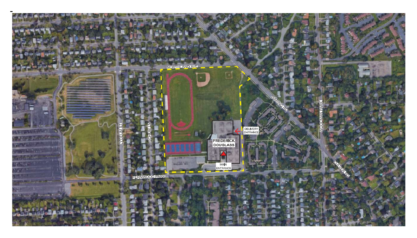
Location of Frederick Douglass Campus Relative to Neighboring Streets and Homes